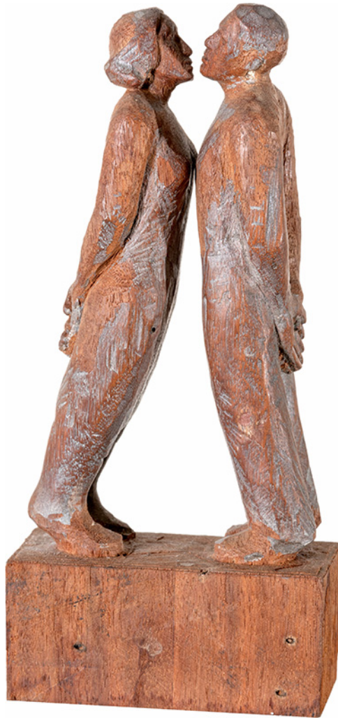
TOGETHER: KISSING 2001-18