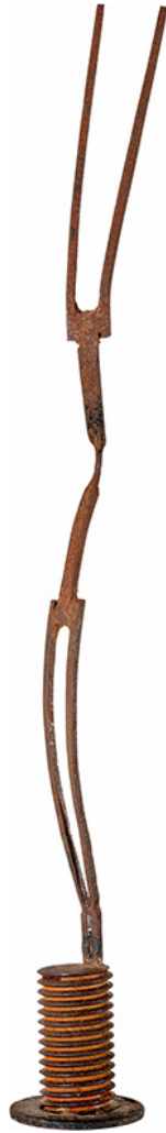
ARCHETYPE FOR 'RAPTURE' 2016