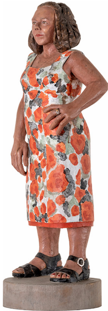
FELLOW HUMANS: FIONA FOLEY 2014

Polychromed wood 54 × 17 × 17 cm $13,200