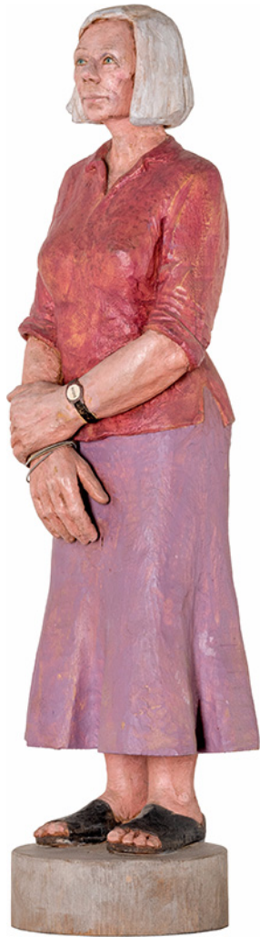
FELLOW HUMANS: JUDITH WRIGHT 2014

Polychromed wood 57 × 14 × 14 cm $13,200