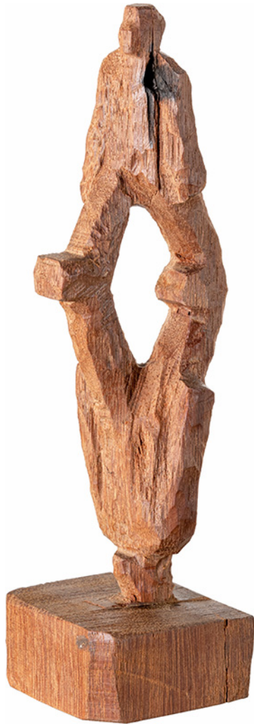
ARCHETYPE FOR 'THOUGH I WALK' 2000