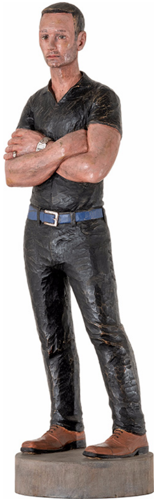
FELLOW HUMANS: MICHAEL ZAVROS 2014

Polychromed wood 61 × 17 × 17 cm $13,200