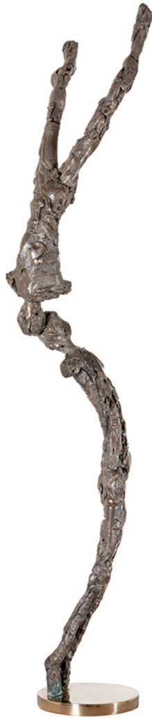
WORKING MODEL FOR 'RAPTURE' 2016